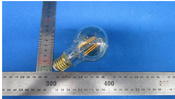
Overview of sample 12221