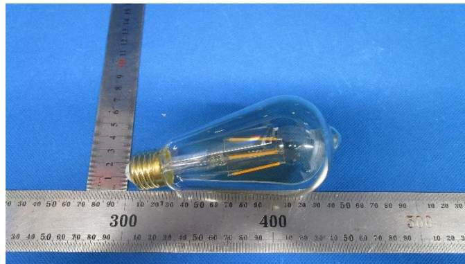
Overview of sample 12222